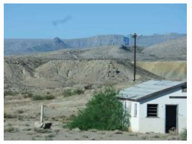
(East Needle Peak seen in the distance from our meeting spot in Terlingua)

took off on foot again. Too soon, it was time to go, so back. So into the dusty Jeep, down the road we went, taking several pounds of dust and dirt on our car. It was a good day but the shower was very welcome that night.